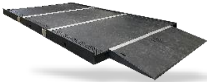
Drive On Containments Decks 12' x 24' w/Ramps