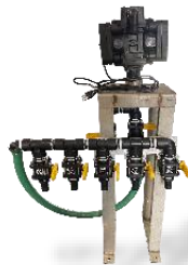
Sump Recovery Pump