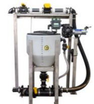
Eductor Bowl w/Meter 3C