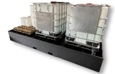
IBC Containment 2