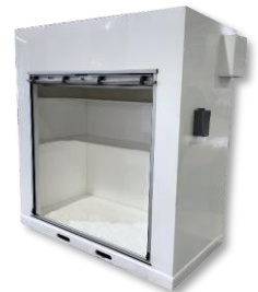
4'x8' Chemical Storage Building