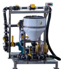
Complete skid w/ 2" pump, meter, eductor bowl 3D