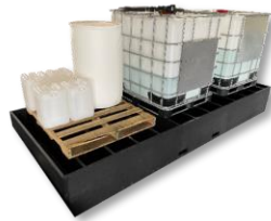
IBC Containment Basin 60"x144"L