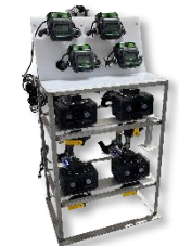
Pre-Set Transfer Pumps 4