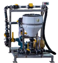
Complete Skid unit: 15-gallon educator w/Flow Meter & 2" Pump