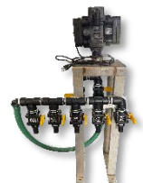
Sump Pump Kit 5