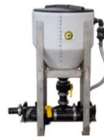
15 Gallon Base Educator