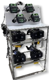
Pre-set Chemical Transfer Pump's w/Meters