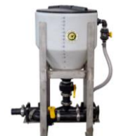
Eductor (Basic) 3A